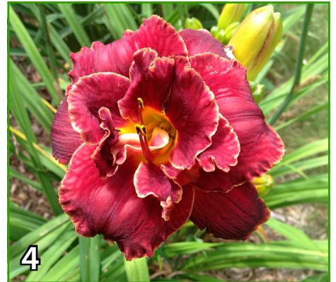
A very few of the gorgeous flowers adorning Ken Mosher's gardens. 1. Liliium 'Purple Prince' 2. Gerbera daisy 3. Gazania rigens 4. Hemerocalis 'Night Embers', a daylily