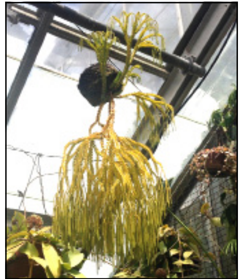
A Huperzia phlegmaria (Tassel Fern) found in one of the greenhouses at the WAVE HILL PUBLIC GARDENS. It is a spore-bearing epiphyte that grows on the branches of rainforest trees in the Old World tropics.