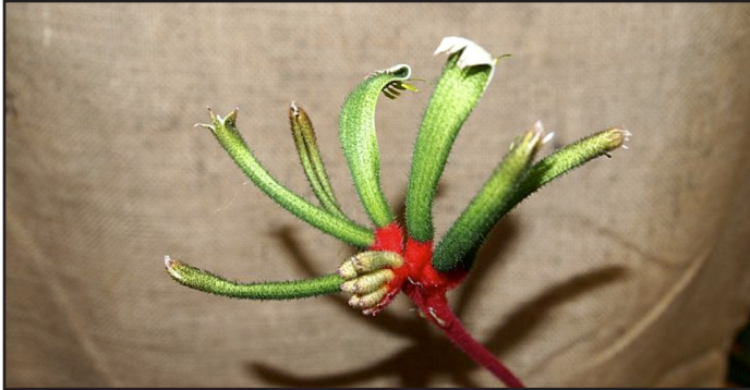
The spectacular florescence of Anigozanthos manglesii, the floral emblem of Western Australia and a member of the kangaroo paws. The plant was auctioned off at our March meeting.